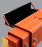
Arm Tool Tray