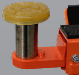
Screw Pad / 4WD Adapter