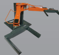
Tyre Holder Adapter