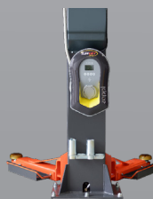
EV Charging Station